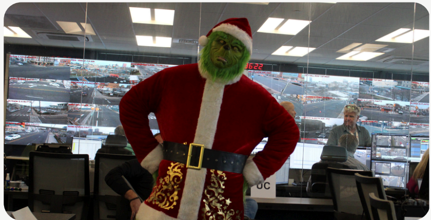
The Grinch Visits the EOC during Parade Operations.