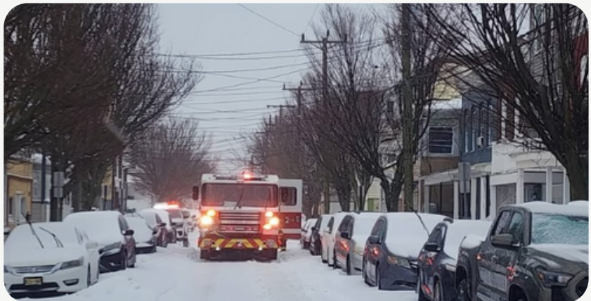
ACFD assisting community members during the winter storm