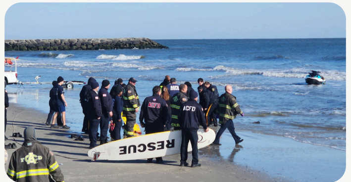
Water Rescue | December 31, 2025

Atlantic City Fire and Police personnel respond to a cold-water rescue.