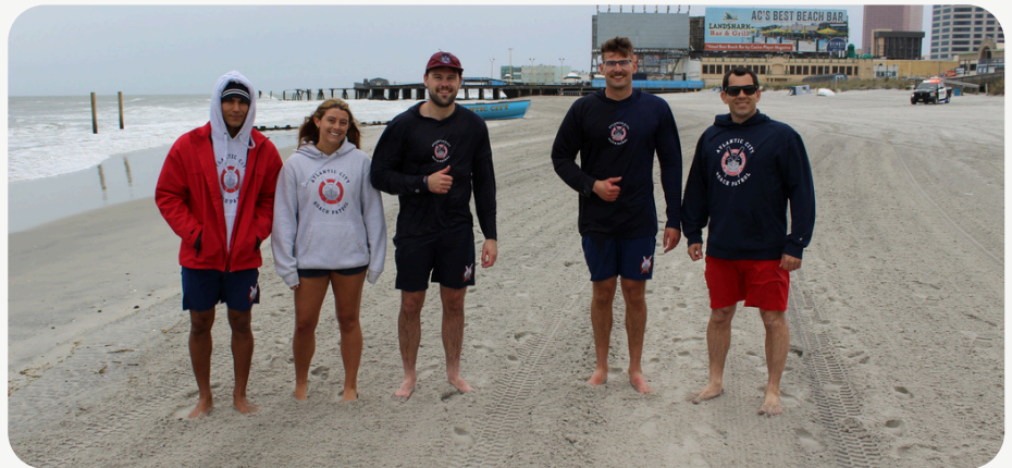
Atlantic City Guarded Beaches Now Open for the Season!