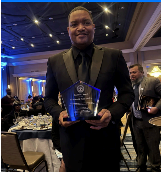
(NAACP FREEDOM FUND GALA)